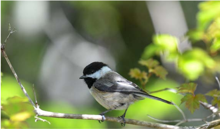
Spring and summer

Adult Black-capped Chickadees do not migrate, though the young sometimes move southward within their range, especially when reproduction is high. These movements are irregular though, so they are more accurately labeled “irruptions” rather than “migration.”