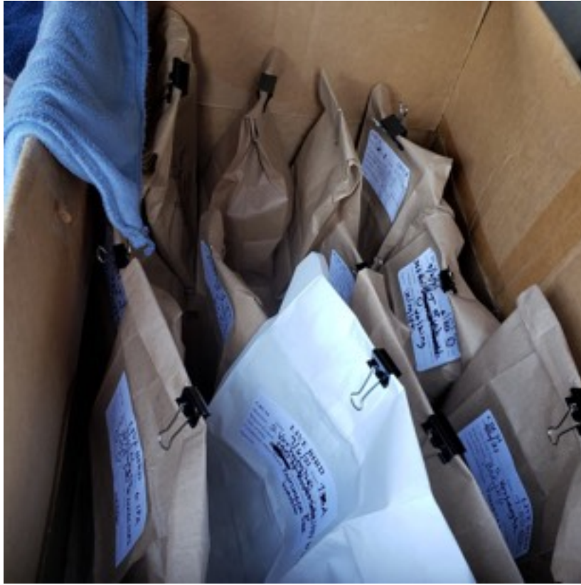
A dozen of the dozens of CBCM rescued (live!) birds from a recent September morning.

Luncheon coming soon, with more events coming down the pike. In between club activities, I hope you're communicating and meeting with other club members as much as you'd like to, whether it's emailing, birding together, or just chatting over a cup of coffee. If there's a way you'd like the club to be social that we're not covering, drop me a line.