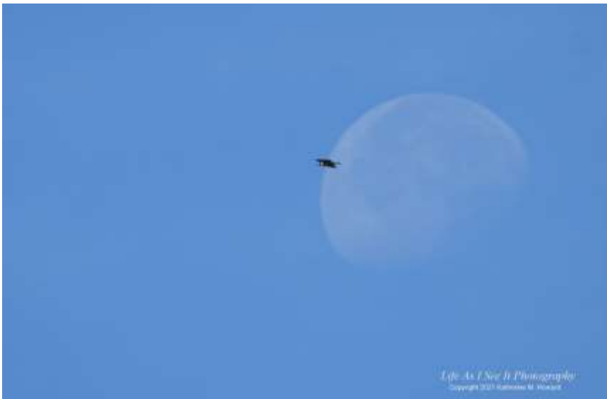
Osprey traversing the moon!

That's what keeps us coming back...the birds, the friendships, but perhaps most of all, the genuine feeling of peaceful detachment from that busy world 200 feet below us.