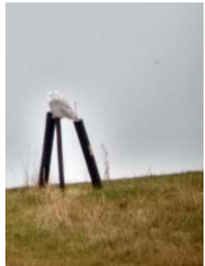
Snowy Owl.