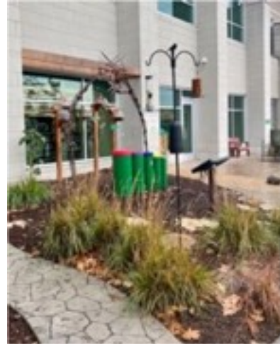
Bird feeders donated to Aurora Public Library's Children's Garden