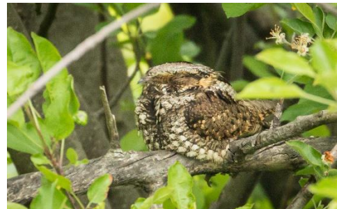
Eastern Whip-poor-will.