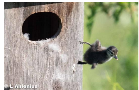
Wood Ducks Fledging.