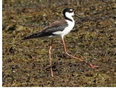
Black-bellied Plover and Black-necked Stilt.

Dowitcher, and Black Tern in the mudflats at Palmary Street Overlook. Along Highway 49 at the north end of the marsh, we spotted a Yellow-headed Blackbird and Redhead ducks. And on the Auto tour section of the National Wildlife Refuge, we saw Bobolinks and many, many Great Egrets. It was a fantastic morning of birding.