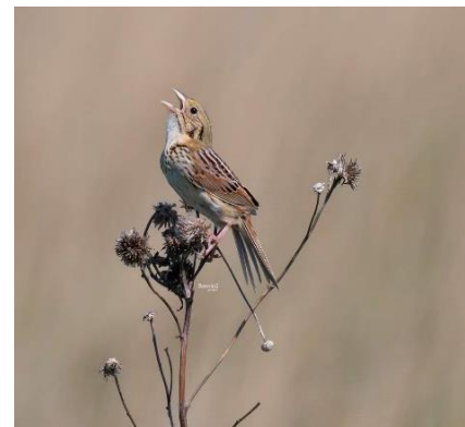
Henslow’s Sparrow.

https://www.youtube.com/watch?v=Jgz0geU980s&t