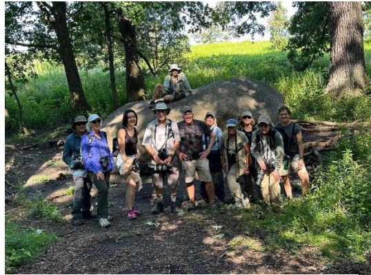
See birds and make new friends at a DBC field trip!

Registration is not required, but please email the trip leader if you plan to attend so you can receive any trip updates.