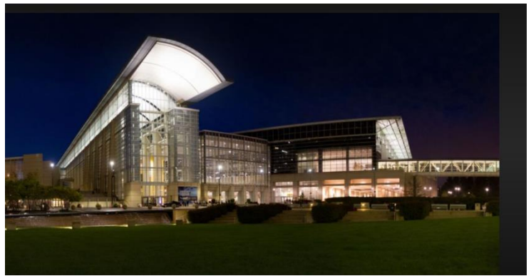
McCormick Place Convention Center

The big news, of course, is that McCormick Place has begun a $1.2 million project to retrofit its glass façade with a bird-safe film that will deter migratory birds from flying into the building's windows. After a tragic night in October of 2023 in which almost a thousand migratory birds perished as they crashed into McCormick Place's glass