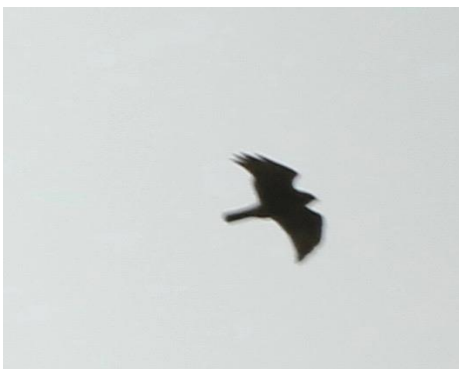
Our first American Goshawk in three years!