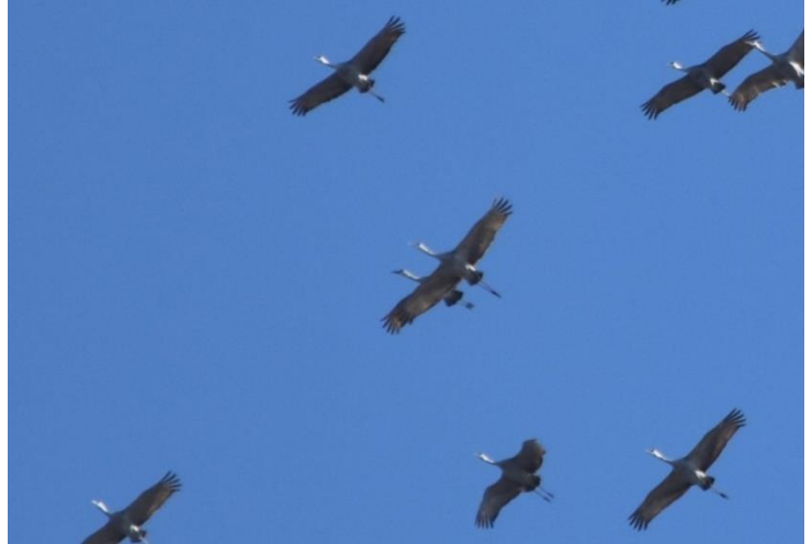
Tandem Sandies! Who knew?

The Greene Valley Hawkwatch is now up to 193 species recorded over our 18-year history. It keeps us coming back...the birds, the friendships, but perhaps most of all, the genuine feeling of peaceful detachment from that busy world 200 feet below us. The 2024 season fast approaches! Let's put our eyes on the sky once again!