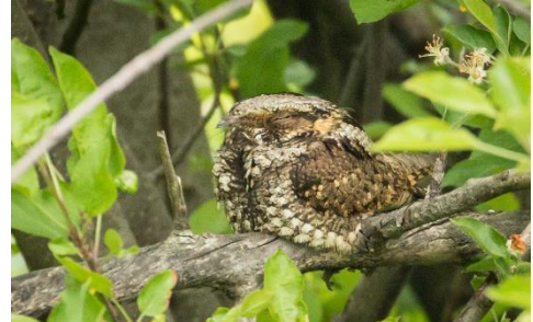
Eastern Whip-poor-will.