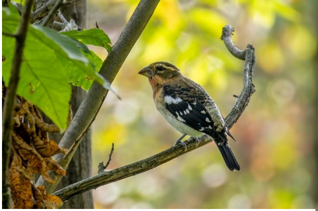
Rose-breasted Grosbeak.

Field Trips will observe a few guidelines to ensure that birding is safe and comfortable for all: