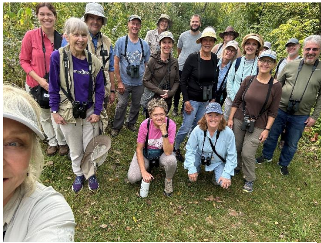
from a recent field trip to Elsen's Hill.

NOTE: For trips with a participant limit, registration with the trip leader is required. In those cases, you are NOT registered until you receive a confirmation from the trip leader.