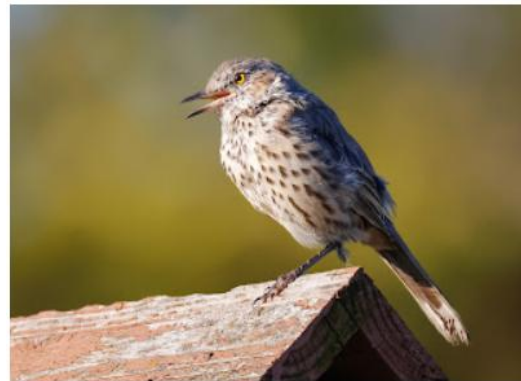
At least 200 birders saw this Sage Thrasher at Hidden Lake Forest Preserve in Glen Ellyn.