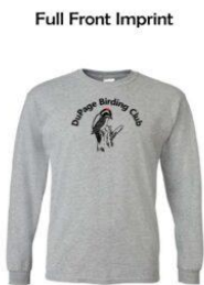
Full Front Imprint