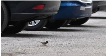
Harris Sparrow under car

A funny and only-at-Magee Marsh experience: We had just finished a whole day of birding at the boardwalk. Highlights were a Bay-breasted Warbler and a Harris's Sparrow. We were exhausted and ready to leave. To our surprise, we found the Harris's