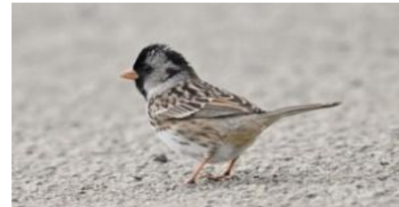
Harris Sparrow

A funny and only-at-Magee Marsh experience: We had just finished a whole day of birding at the boardwalk. Highlights were a Bay-breasted Warbler and a Harris's Sparrow. We were exhausted and ready to leave. To our surprise, we found the Harris's