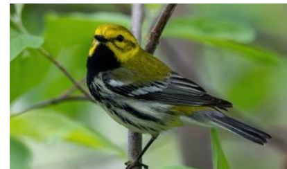
Black-throated Green Warbler