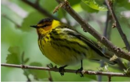
Cape May Warbler

Driving towards Toledo. It has been raining all the way. The only good thing is that we see a complete rainbow. And that was only the beginning of our 3-day DBC trip to Magee Marsh for the Biggest Week In American Birding. 18 members, 24 checklists, and 131 species later, we were tired, sad to leave, and so grateful to have had the chance to have amazingly long and close-up looks at birds we've rarely seen, with old and new friends, and an incredible leader.