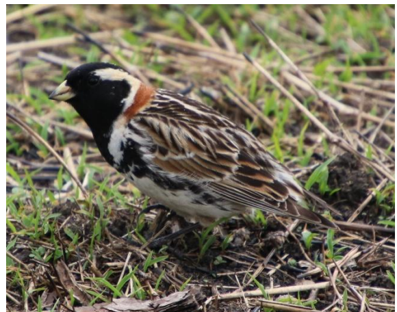
Lapland Longspur.

One of the fun aspects of birding is going out with expectations of finding some interesting or rare birds, and our fellow spring bird counters came up with some good ones for this year's count. Topping the list of rare birds is the addition of a Lapland Longspur to the Spring Bird Count list. Diann Bilderback discovered a beautiful male longspur at Northside Park in Wheaton (see photo). This is the first record of a Lapland Longspur on the Spring Bird Count after over 50 years of completing spring counts in DuPage County. Congratulations to Diann for finding this great bird in a very unlikely location for a longspur.