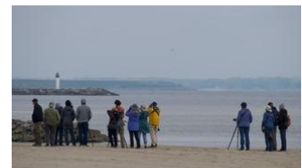
Our group at Maumee Bay State Park on Lake Erie