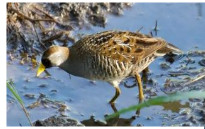
Sora by Sherry Courtney

The highlights included finding the Franklin's Gull next to Caspian, Common, and Forster's terns all standing together, prompting Matt to give us an impromptu tern ID talk. Sitting out an evening thunderstorm in our cars, only to emerge into the beautiful sunlight, fresh air, and back onto the boardwalk where we had a long, close look at the elusive Sora. Seeing a Snowy Egret. Spotting a Sandhill Crane couple, and then the emergence of 2 colts! Seeing the Black-billed Cuckoo. Really great ice cream! A few years ago, Trumpeter Swans were almost extinct. We saw over 100+ in one day!!